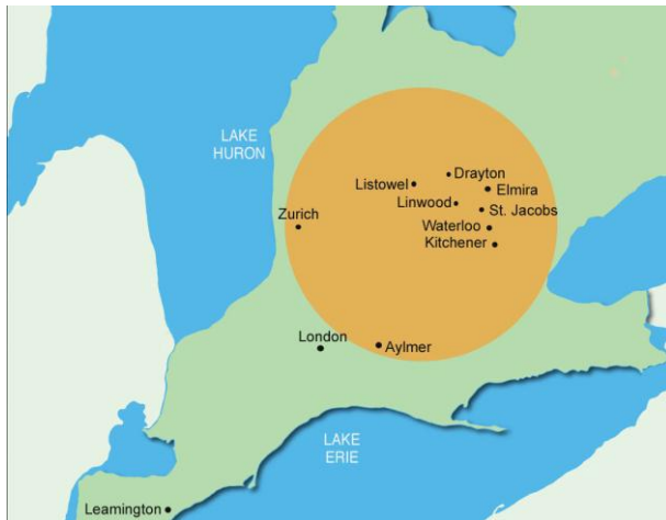
Figure 1. Map of South Western Ontario – K. Turner

The four main themes that underpin this thesis emerged from my analysis of the interviews that I conducted. These four themes – migration, economics, education and technology – form the foundation for the research questions and the following discussion on Old Colony Mennonites and their relationships with digital technologies. The themes are interconnected; no one chapter exists without reference to the others.