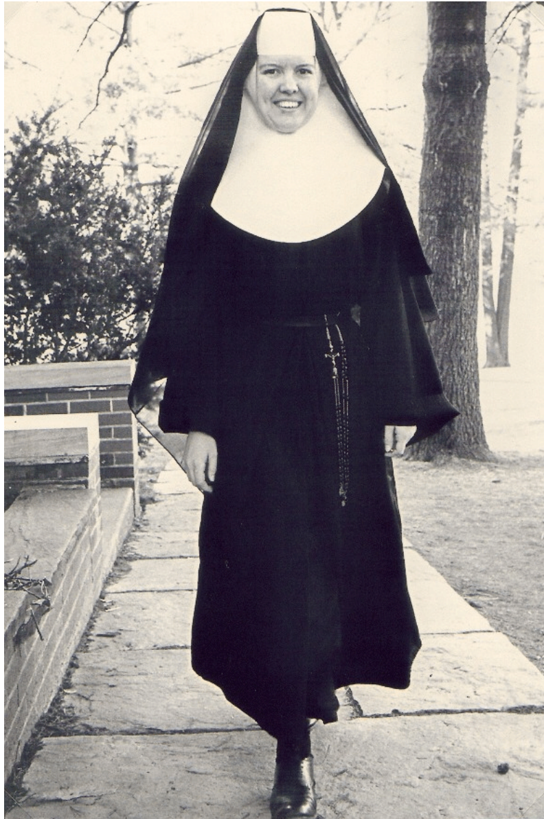
Traditional Ursuline Habit, circa 1967. Ursuline Archives, Chatham, Ontario.