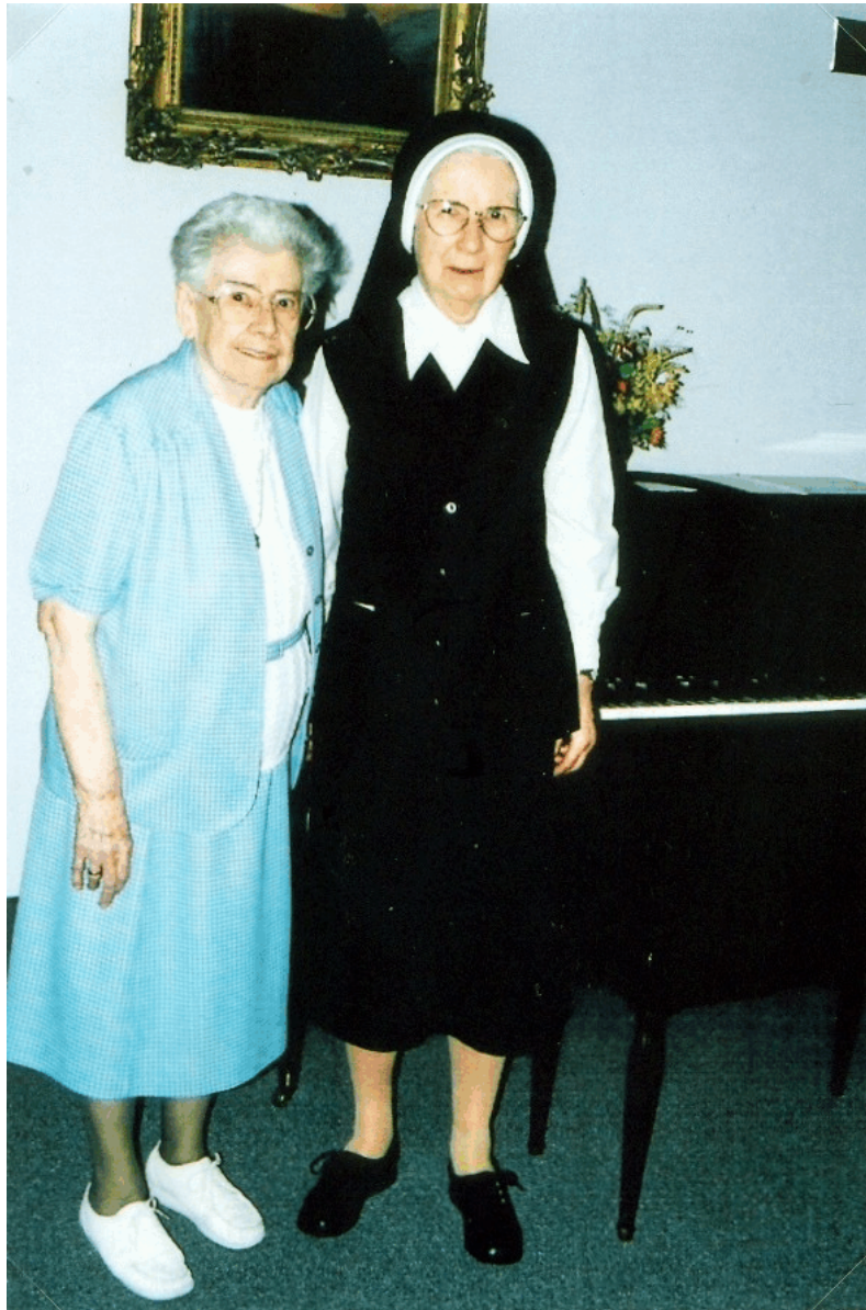
Sister in lay clothing (left) and Sister in modified Holy Names Habit (right), circa 1975.