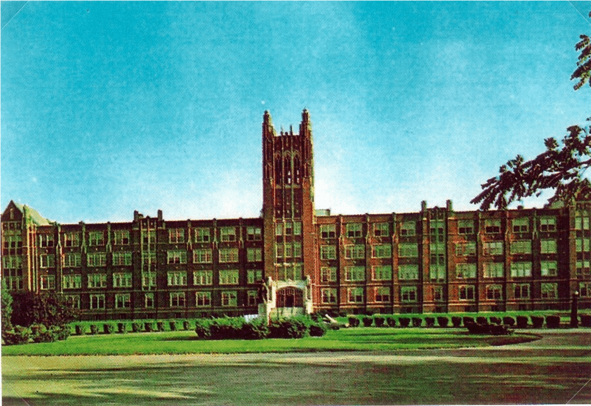
St. Mary's Academy, Windsor, Ontario, circa 1960.