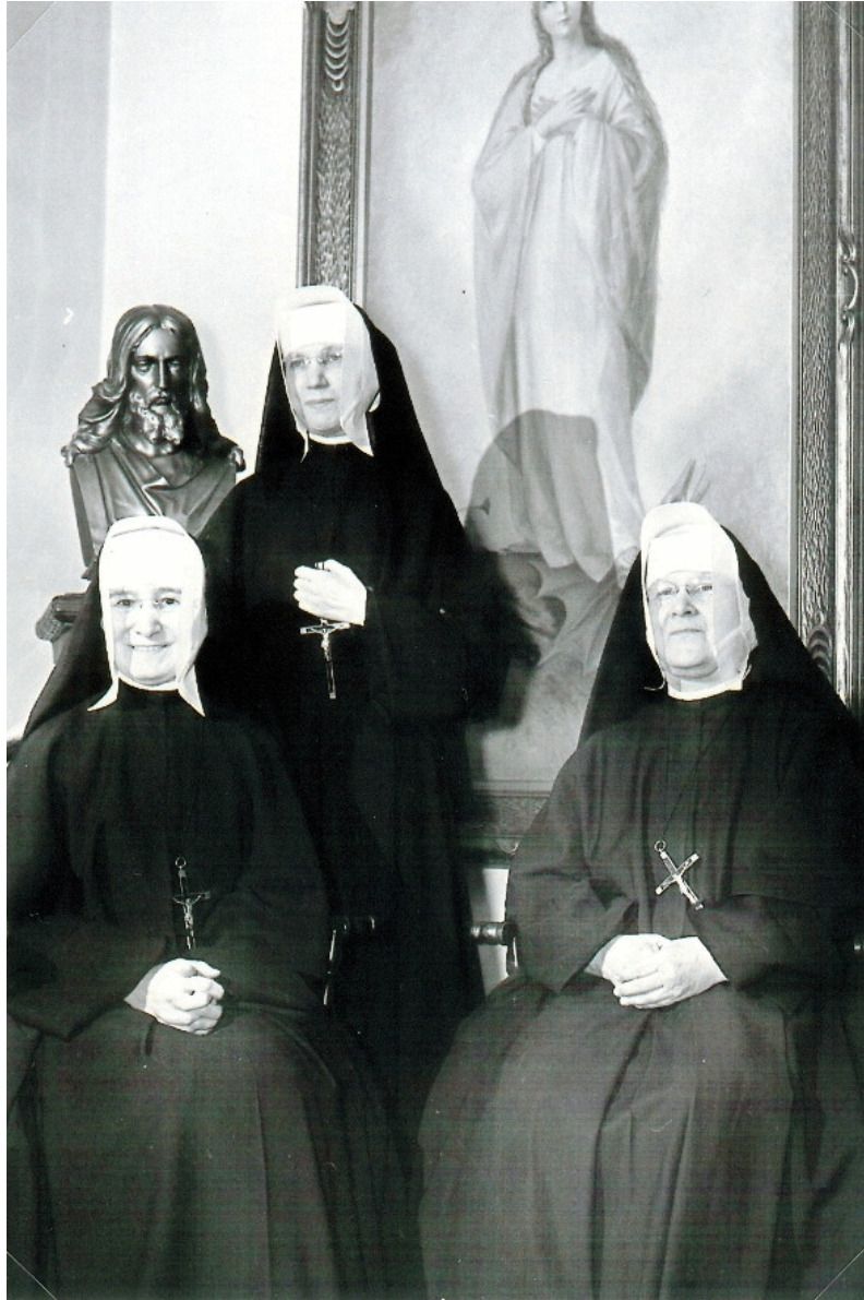
Traditional Holy Names Habit, circa 1960.