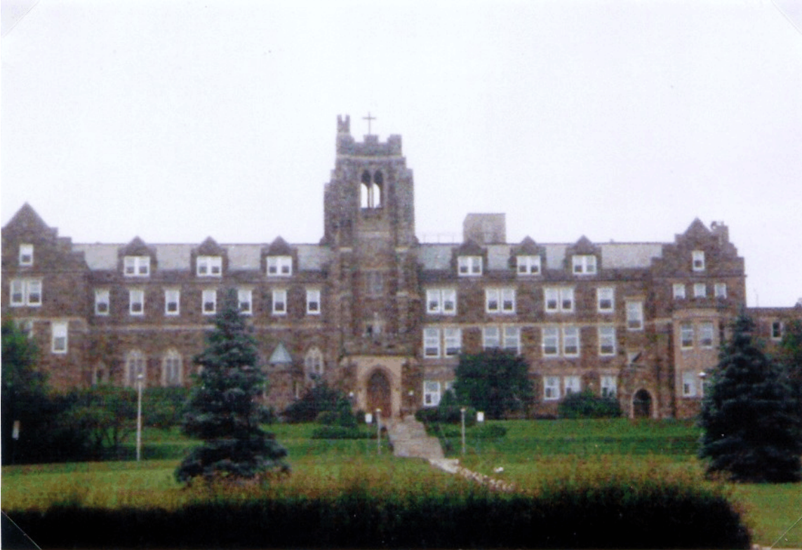
Brescia College, University of Western Ontario, circa 1950.