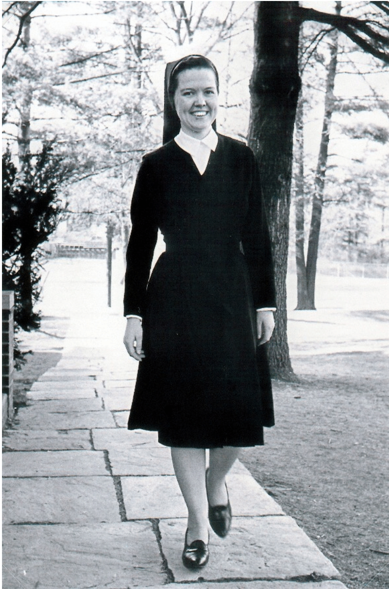
Modified Ursuline Habit, circa 1967.