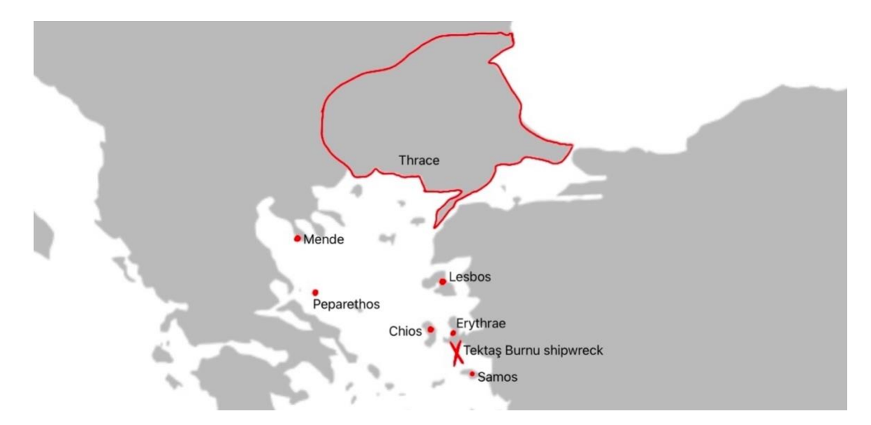
Figure 2: Map of Tektaş Burnu shipwreck location and where cargo possibly came from.

The wreck site at Tektaş Burnu was identified by a mound of transport amphorae on the seabed in 1996 (Carlson 2003:581). After three field seasons, which resulted in it being the first Classical wreck to be cully excavated in the Aegean (Carlson 2003:598), archaeologists had recovered approximately 200 transport amphorae. These amphorae were categorized as primarily being Pseudo-Samian in style (Carlson 2003:583), with ten being categorized as Mendean (Carlson 2003:587), two as Chian, three as Samian, and two as Northern Aegean (possibly from Lesbos, Thrace, or Peparethos) (Carlson 2003:590). As will be discussed below, the Pseudo-Samian amphorae were possibly produced in nearby Erythrae (Carlson 2003:581), meaning the ship either stopped at or came from Erythrae.