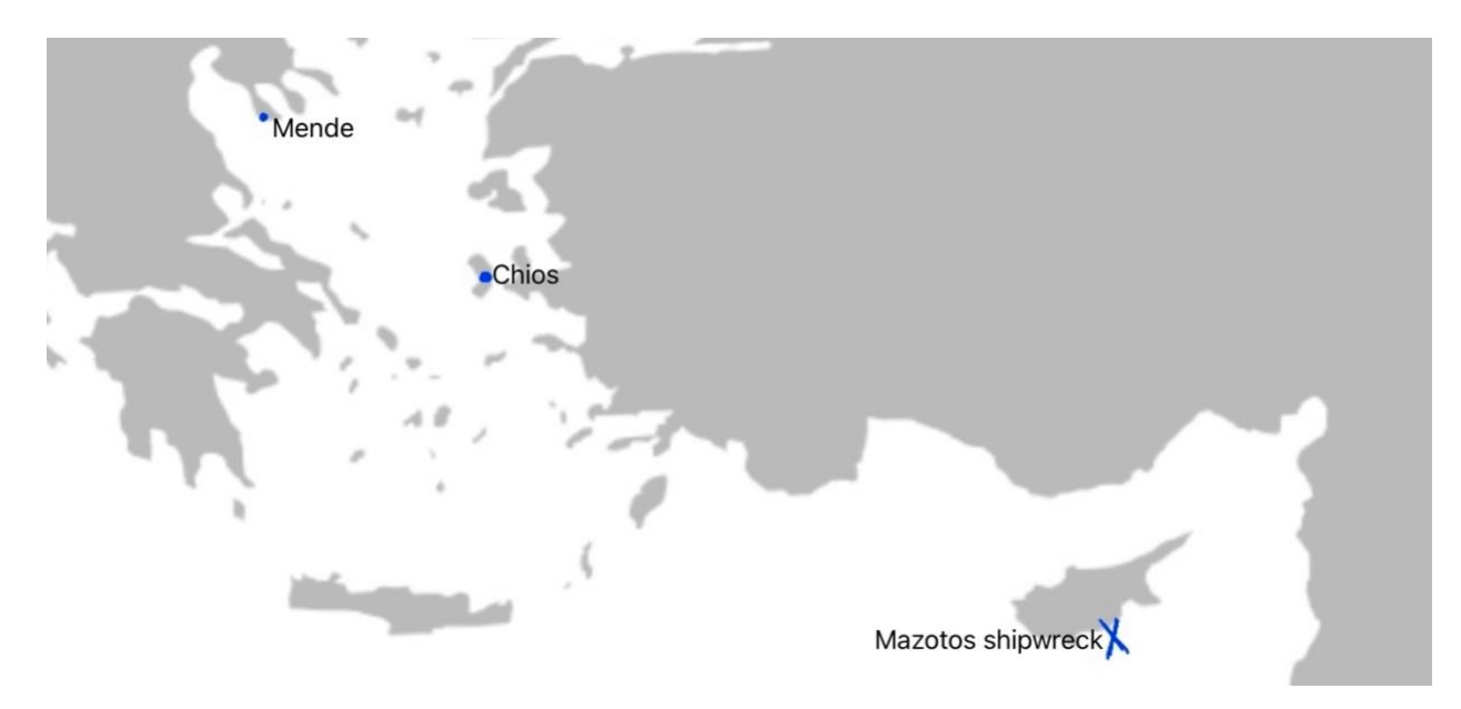
Figure 4: Map of Mazotos shipwreck location and where cargo possibly came from.

The Mazotos wreck continues to be the subject of in situ research, so until the excavation is concluded, it is difficult to know how many transport amphorae this ship carried. However, current estimates place the quantity at approximately 500 transport amphorae (Demesticha 2011:39). These amphorae are largely of Chian origin (Briggs et al. 2022:781), leading to the assumption that these amphorae may have carried wine from Chios since the island was well-known for its production and export of high-quality wine (Briggs et al. 2022:781; Demesticha 2011:48). Less than ten of the excavated amphorae have also been identified as coming from the southeastern Aegean and northern Aegean (possibly Mende) (Katzev & Swiny 2023:379). Many of these amphorae also had pitch lining on the interior walls, consistent with the idea that these amphorae carried wine; however, previous researchers also note that other commodities, such as fish sauces, fruits and olives, may also have been carried in pitch-lined amphorae (Demesticha 2011:48). In the context of the Mazotos wreck, it is largely agreed upon that wine was most likely the primary commodity (Briggs et al. 2022:781; Demesticha 2011:48).