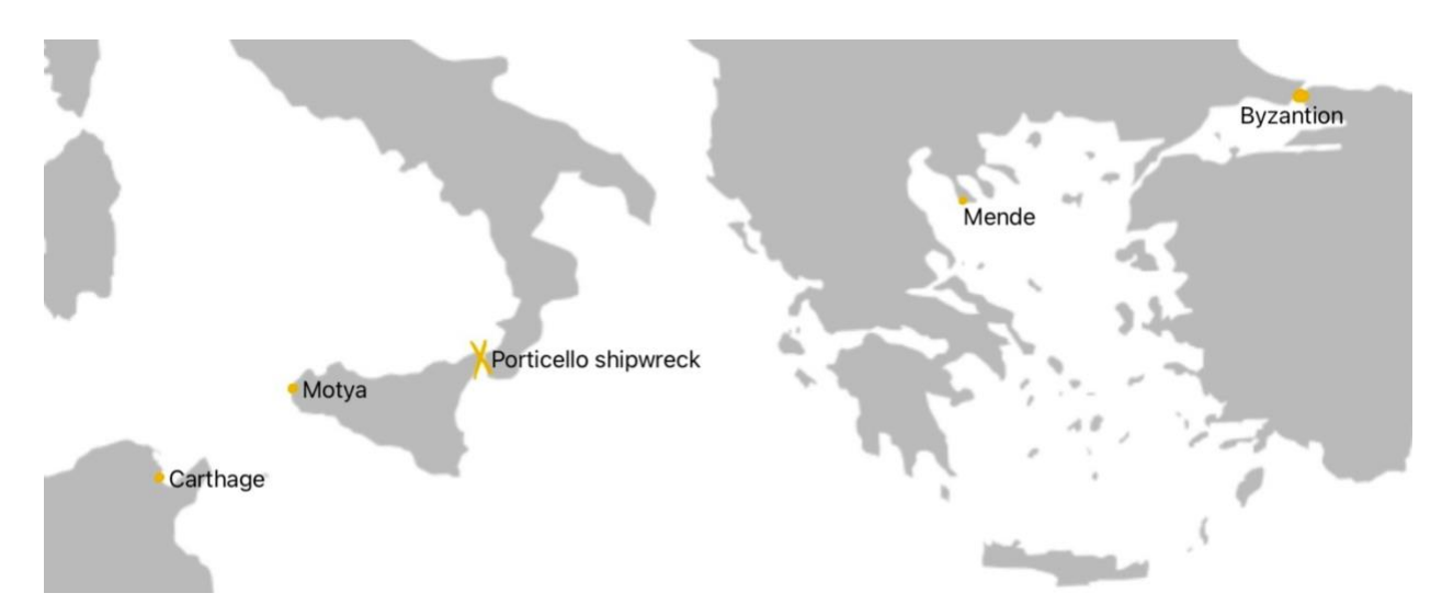
Figure 3: Map of Porticello shipwreck location and where cargo possibly came from.

The Porticello shipwreck produced fewer amphorae than other wrecks discussed in this research. Immediately after its discovery in 1969, the wreck was heavily looted by fishermen and divers (Eiseman & Ridgway 2012:3-4). Reports about the transport amphorae from the wreck consider only the ones excavated by the University Museum excavation team of the University of Pennsylvania in 1970; others that probably came from the wreck were recovered in police investigations, but could not be definitively proven as coming from the Porticello wreck (Eiseman &