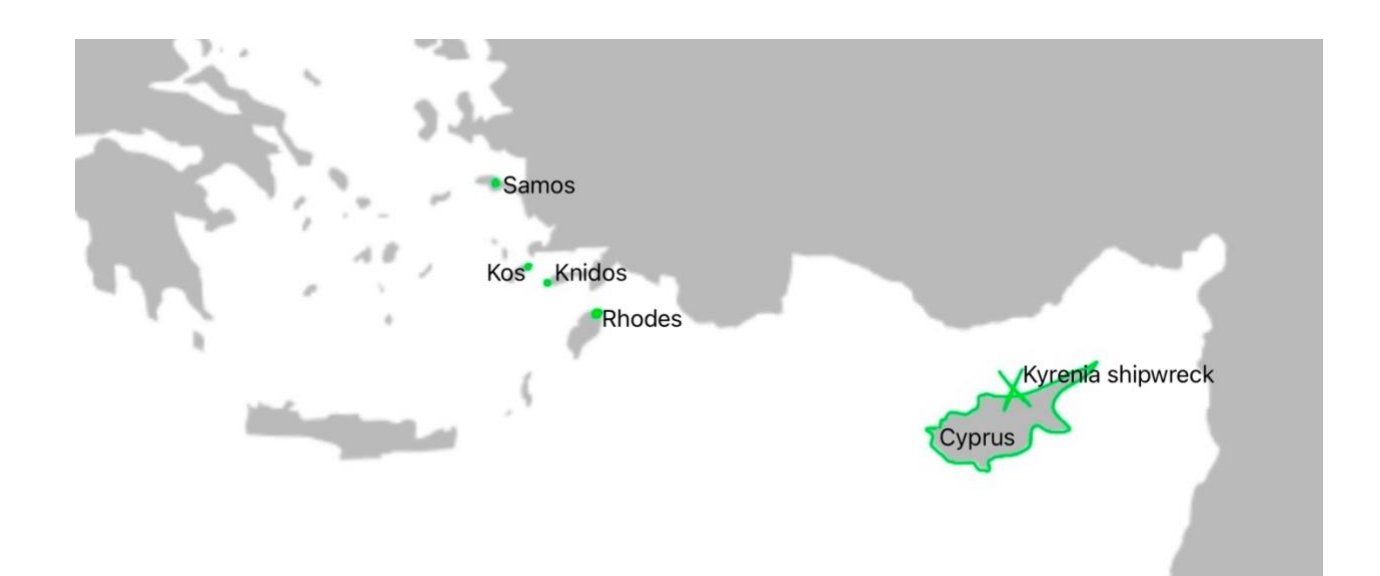
Figure 5: Map of Kyrenia shipwreck location and where cargo possibly came from.

Over the course of two field seasons in 1968 and 1969, archaeologists recovered a total of 403 amphorae and amphorae fragments from the Kyrenia wreck site (Katzev & Swiny 2023:89). After conservation in subsequent seasons, this count was reduced to 379 separate amphorae (Katzev & Swiny 2023:89). These amphorae were categorized according to Michael Katzev's working