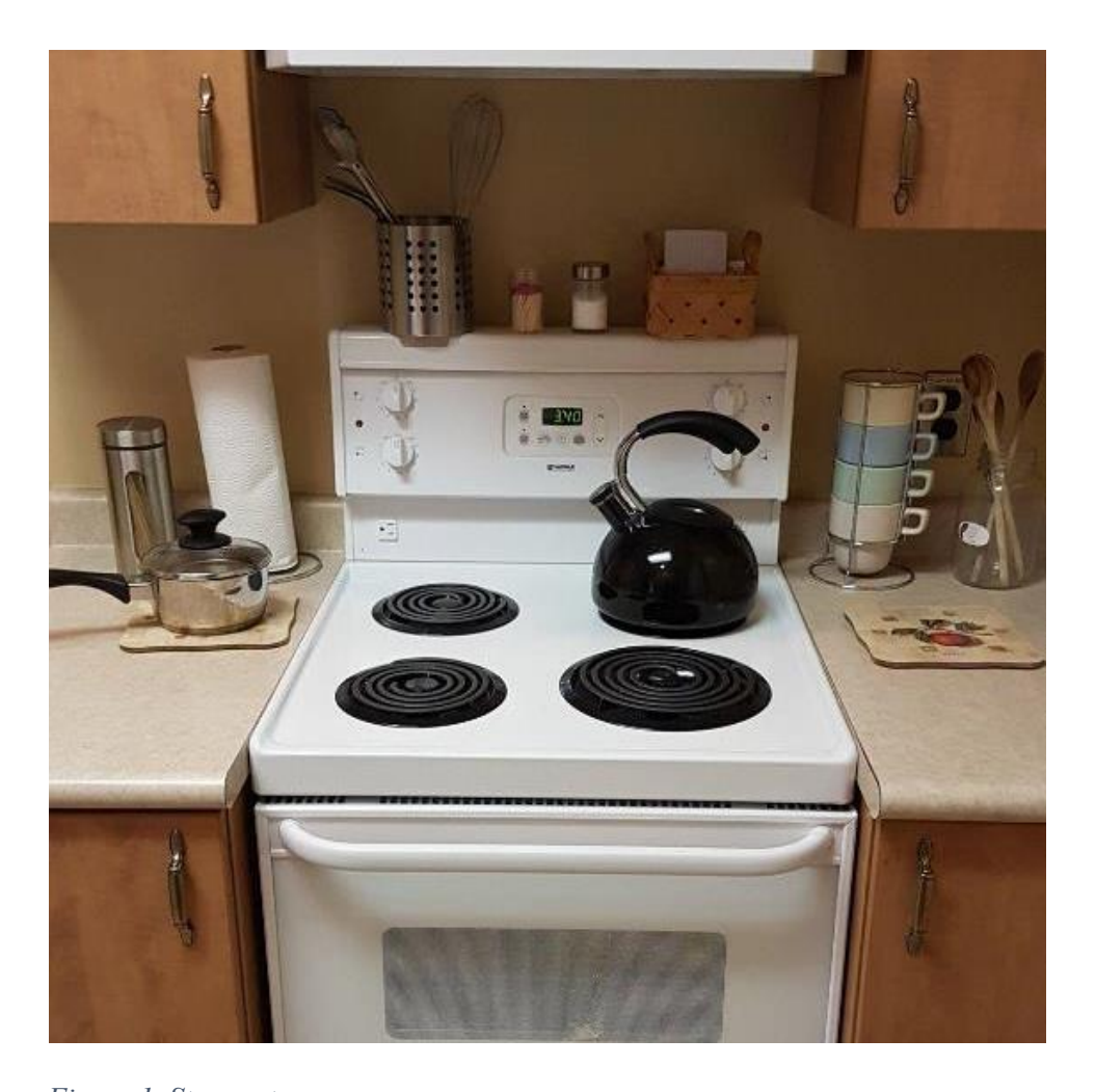
Figure 1. Stove set up.