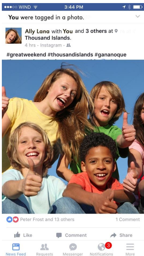
Figure 2 An example of the supplementary visual aids used with the scenarios in both conditions.

Children explained what they would do and how the situation might affect their own and others' privacy. The pre-tests established a baseline for each child, and the questions were repeated verbatim in the post-tests. The 1-week-tests evaluated the same concepts but contained alternate scenarios.