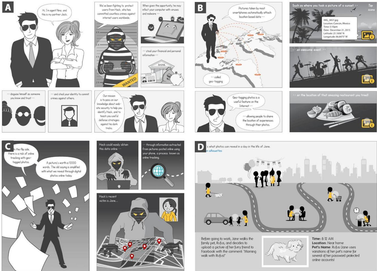
Figure 1 Sample screens from Secure Comics ' privacy chapter. Screens B & D have interactive features. A) Intro; B) Geotagging (with interactive picture icons); C) Online tracking; D) A day in the life of Jane (with interactive activities map). N.B navigation cropped

retention (Negrete and Lartigue 2004). In political cartoons, comics were used to persuade readers toward a certain position through visual-textual metaphors and caricatures (Treanor and Mateas 2009). Comics were found to be effective at changing readers' attitudes, such as youths' attitudes toward mental health (Rose 1958). Health "graphic stories" (e.g., (Marchetto 2014)) were used to provide patients the means to learn about their illness while illustrating potential physical and emotional experiences through fictional characters and narrative. Medikidz (2016) created a series of comic books that teach children about common health conditions such as asthma and childhood obesity. In children's privacy education, a graphic novel by the The Office of the Privacy Commissioner of Canada (2016) tells the story of two siblings who encounter privacy risks related to social networking, mobile devices, and gaming. However, the comic has not been empirically evaluated for effectiveness.