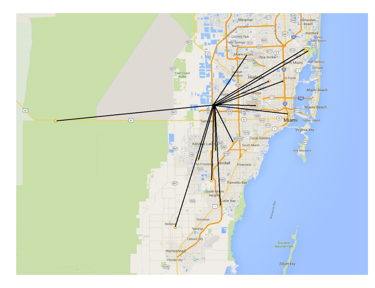
Figure 1 – Topology of the Miami-Dade Sheriff's Department wireless network.

The network we chose to focus on in this work is the eighteen node network used by the Miami-Dade Sheriff's Department. This network consists of the central node located at the central station in Doral, 15 other nodes located at various stations across the county, and two repeaters located within the county. The topology of the network can be consider a star topology (see Figure 1) due to the fact that all nodes are directly connected with the central 911 station. For the purposes of this analysis of potential attacks on wireless networking aspects of the emergency management network used by the sheriff's department, we are only considering wireless links between these nodes and take into account each mobile sheriff vehicle. The implied technological constraint of range of transmission and limitations of transmit power imply that each node covers a defined geographical range with information being relayed to the central 911 as needed from other stations and repeaters.