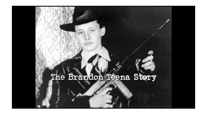
Figure 8: The opening sequence of The Brandon Teena Story with personal photo of Brandon as a gangster