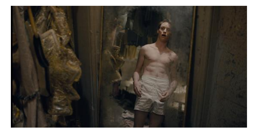
Figure 4: Lili Elbe's internalized "reveal" moment in Tom Hooper's The Danish Girl .