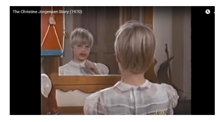
Figure 1: Young Christine puts on make-up (from The Christine Jorgensen Story).