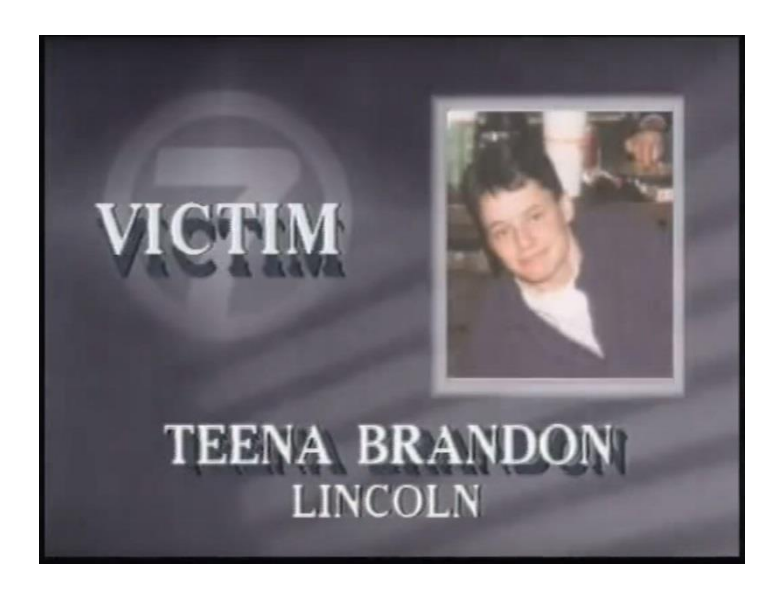
Figure 9: Police image used to announce the murder of Brandon Teena