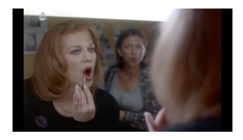
Figure 11: Judy in the bathroom in Better Than Chocolate.