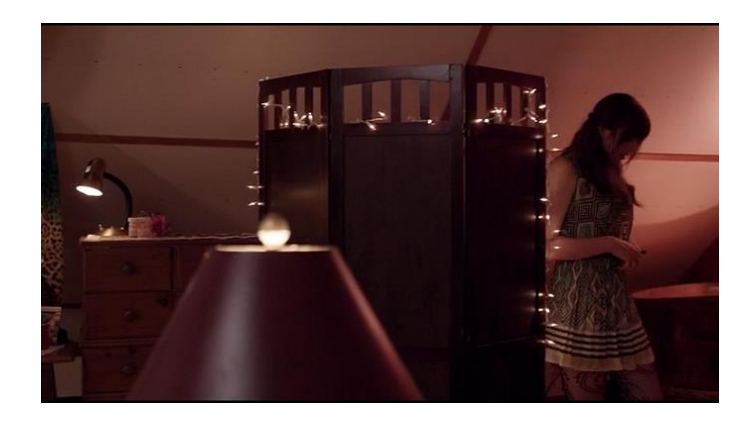
Figure 12: Ricky's hormones in Boy Meets Girl. This is one of several scenes.

Credit: screenshot taken by author (Distributor: Wolfe Video).