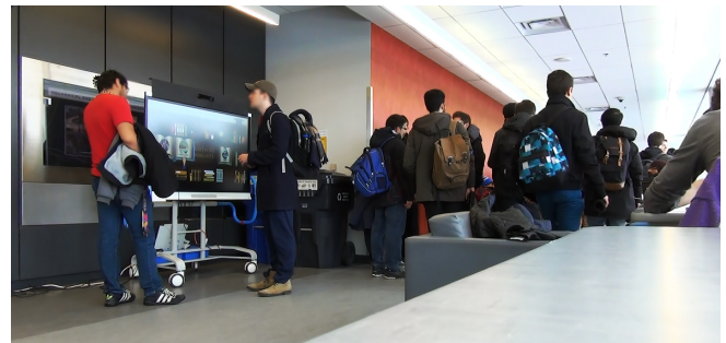
Figure 1. We explored the impact of proxemics and conation on user engagement with large, interactive displays. Our field deployment spanned 4 days, and included more than 2600 encounters.

Researchers have found that PLIDs often receive limited usage, or even go unnoticed. While individuals are largely familiar