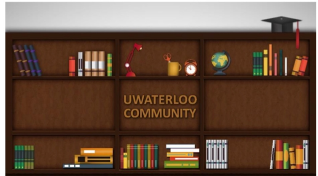
Figure 2. Our experimental platform was based on the concept of a bookshelf that passing students could consult for information such as bus schedules, nearby study spaces, and line-ups at nearby cafes.

Our design uses a bookshelf metaphor (Figure 2), where different types of information are presented as books. This design was chosen based on a number of useful properties: it allows