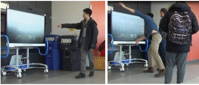
Figure 4. Passersby familiar with the Microsoft Kinect often experimented with various hand and body gestures. These actions often served as a catalyst for others to interact with the PLID.

even peeked behind the display presumably to investigate the hardware being used. Although we anticipated this curiosity, and disguised the Kinect within a black cardboard frame, passersby tried various body and hand gestures in front of the display (Figure 4). Many of these passersby were thus classified as Exploring the display, even though they may not have explored whether the PLID was touch-sensitive.