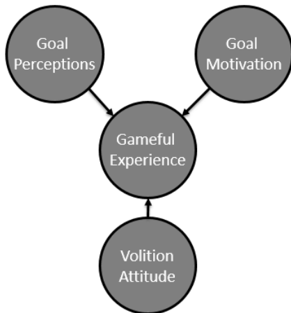
Figure 2. Formative measurement model of gameful experience.